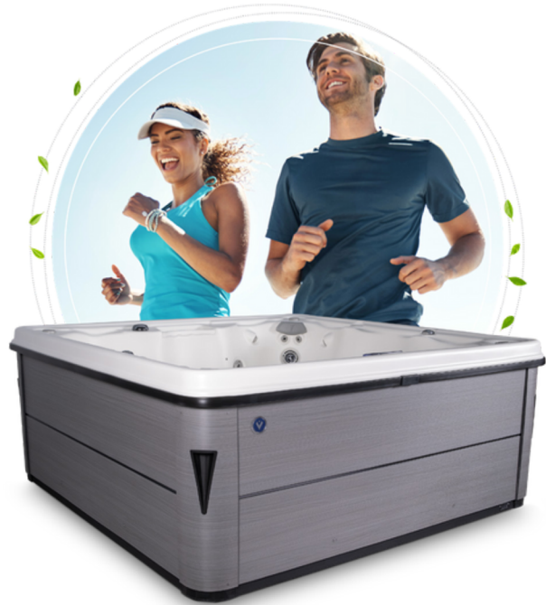
Tradition I spa shown with White Satin Everlast shell, Slate cabinet, standard control panel and optional music system

Indulge in the ultimate relaxation and rejuvenation experience with our spacious open-seating hot tub, the Tradition. Featuring two versions of the unique three-direction "swing" seat with strategically placed jets, this hot tub offers the option to comfortably lounge across nearby seats or sink into generously jetted captain's chairs. This thoughtfully designed model features strategically placed jets that offer comfortable lounging and targeted therapy for your wrists, neck, and feet. Elevate your outdoor hot tub relaxation experience with the Tradition – designed for ultimate head-to-toe rejuvenation.